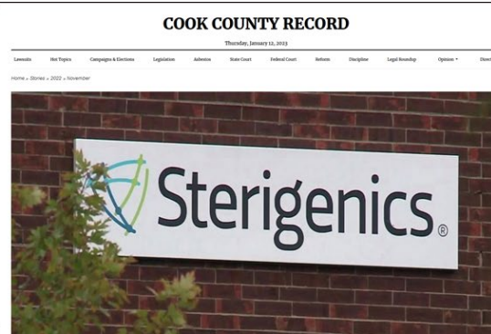
Jury says Sterigenics not liable for woman's cancer, in second trial over Willowbrook EtO emissions