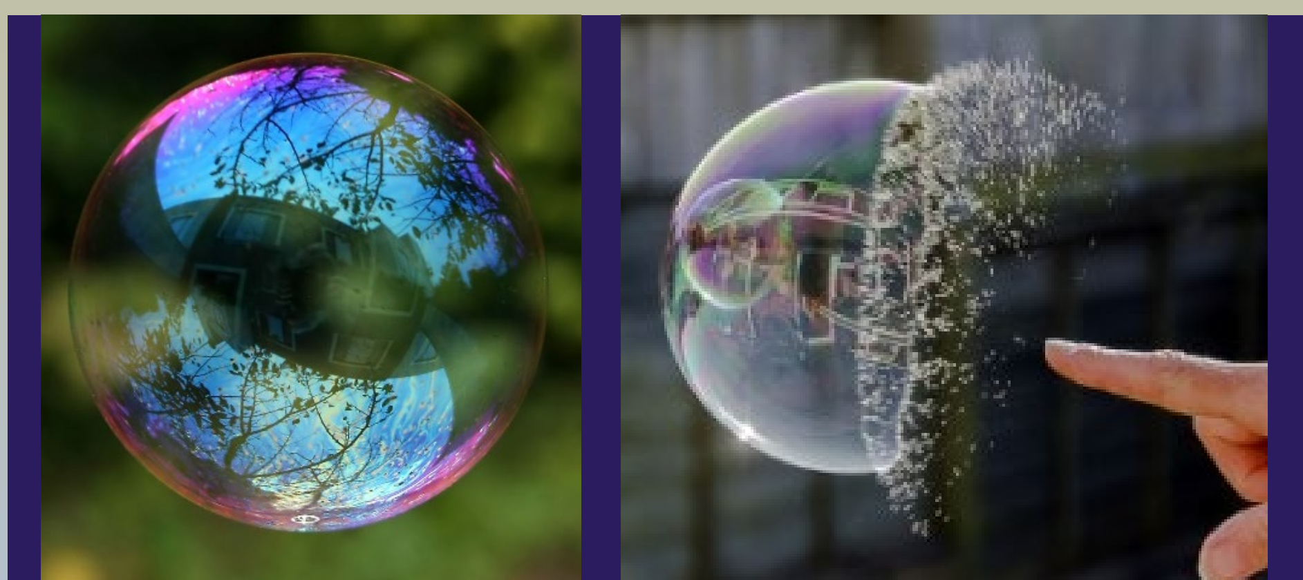
Bursting the savior complex