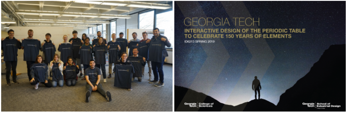
Reference: "Industrial design students reimagine the periodic table – and a book is born" https://cos.gatech.edu/hg/item/621467

4.1 The ID 6213 2019 Spring student project "Periodic Table Makeover" , collaborated with College of Science, delivered six interactive exhibits and a book.